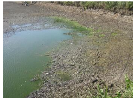
Pond Culture of Tilapia