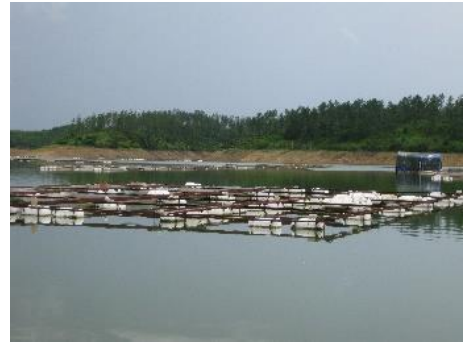
Cage Culture of Tilapia

Freshwater fish farms are typically dirt ponds but come in all shapes and sizes. Some use fiberglass, PVC, or concrete tanks. Others use cages in reservoirs, lakes, or even large ponds. There are several approaches that can be taken to lessen the amount of accumulated organic matter ranging from closing the ponds and allowing them to evolve to biofloc based systems to exchanging water at high rates to flush the accumulated matter out into the environment. The latter is not considered environmentally friendly and is typically not sustainable. Large amounts of organic material flushed into riverine or estuarine systems pose a threat to indigenous fauna and flora as well as other users of the resource.