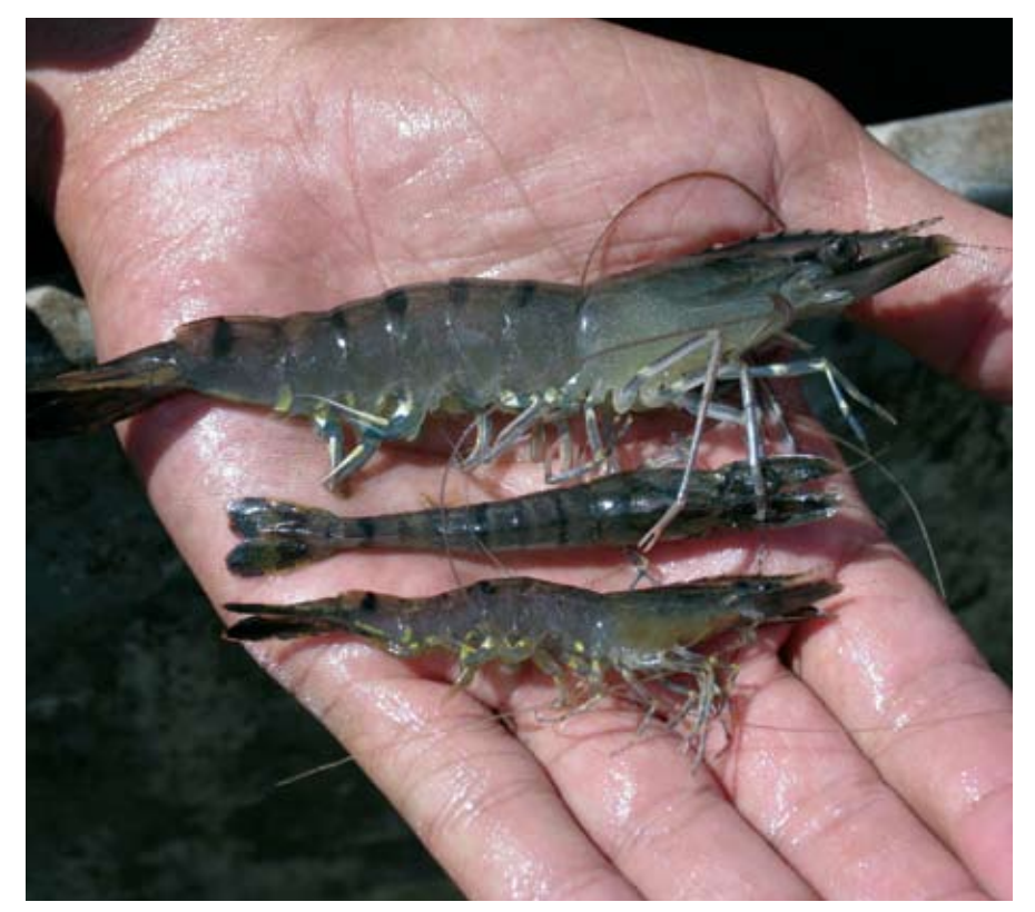
Failure to proactively address disease issues usually leads to significant decreases in production performance.